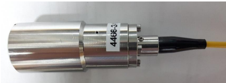
High Power Collimators