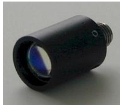
SMA Type Collimator