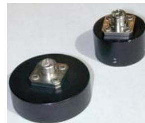
Receptacle Type Collimators